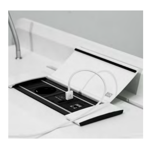
Connector panel "PowerFrame Cover" made up of 3 units (1 each: 230 V Schuko socket, double USB charger, RJ45 Cat 6- / HDMI-input).