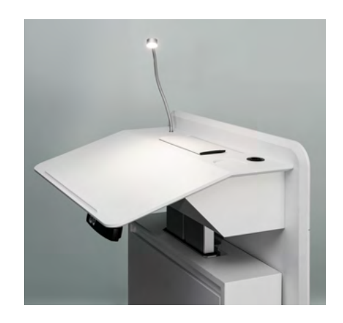
Slanted surface with paper stopper for manuscript or notebook.

Optional: Reading light, electrical height adjustment.