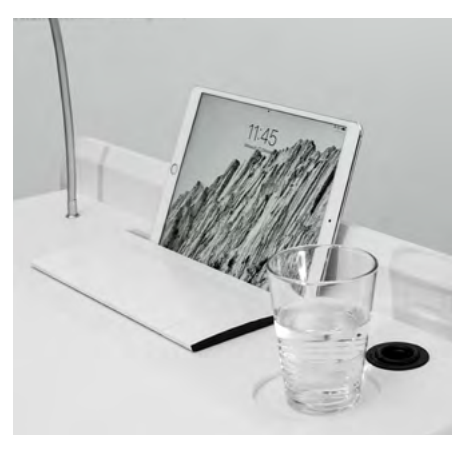
Cutout tablet holder as well as microphone / XLR socket.

Optional: Reading light, electrical height adjustment.