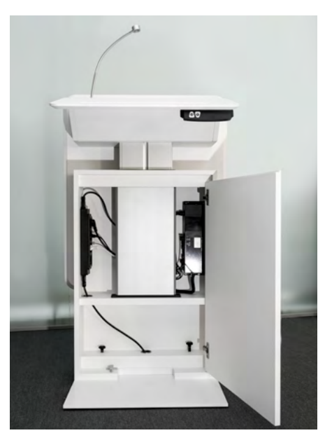
Body cabinet, 1-piece with hinged door and storage space, prepared for the integration of media technology, includes cable to floor outlet, includes 4-socket multi outlet inside the technology cabinet.