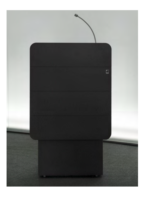
Varnished with structured lacquer. Colors: Arctic White, Lava Black, or customized, against surcharge.